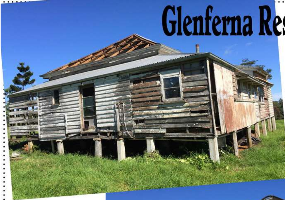
May 2016 before being shifted