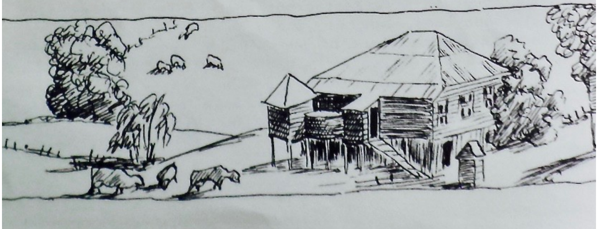
7 Maleny Vista is the house that belongs to Pat Powell referenced to in the section Maleny Vista

The Daylily Nursery is on the left, this is a specialist nursery where a very wide range of daylilies can be purchased, during June 1988 the nursery is to be relocated to Policemans Spur Road, Wootha. McCarthy's Road joins Mountain View Road.